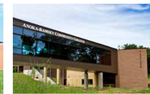
Coon Rapids Campus 11200 Mississippi Blvd NW Coon Rapids, MN 55433