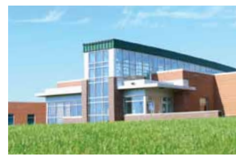
Cambridge Campus 300 Spirit River Dr S Cambridge, MN 55008

One of the best ways to compare colleges is to visit. Tours are scheduled weekly on both campuses; register for a tour online or call 763-433-1300. If you need directions, please visit: AnokaRamsey.edu .