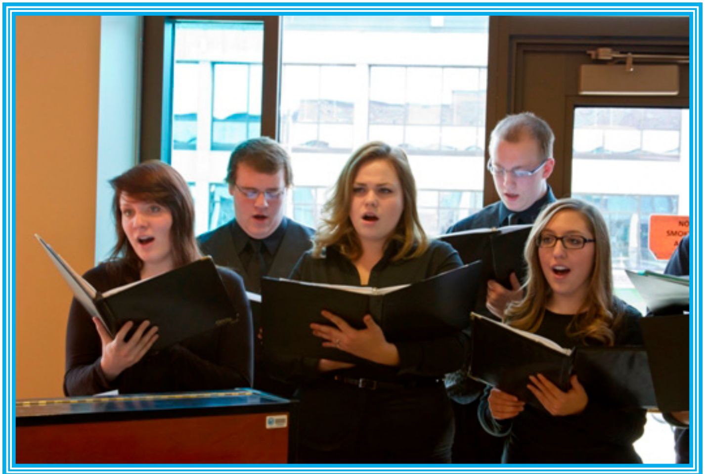
CAMBRIDGE CAMPUS CHOIR MEMBERS

Although the tests do not determine admission to Anoka-Ramsey Community College, they do determine entry into some courses. If the Accuplacer reading score indicates placement into Reading 0910, students will be required to take Reading 0910 during the first semester at the College and Reading 0990 during the next semester of attendance at the College (following successful completion of Reading 0910). Students are encouraged to enroll immediately in the indicated courses when placement is other than into 1000-level courses. Students are expected to complete all courses numbered below 1000 prior to the completion of 30 credits. Students placing below the lowest pre-college level courses offered may be referred to Adult Basic Education (ABE).