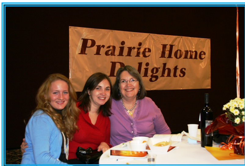
PRAIRIE HOME DELIGHTS FOUNDATION EVENT ATTENDEES

Since 1987, the Foundation has raised over $3,721,113 in financial support. This support has provided over 2800 scholarships ($1,914,000) to area residents. The Foundation has provided over $604,000 in College support, and $122,400 has been awarded to faculty members for projects designed to enhance the classroom experience for the student.